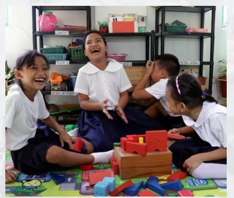
Learning competencies must be age-appropriate