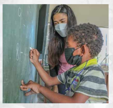
Learning starts from what learners already know and can do