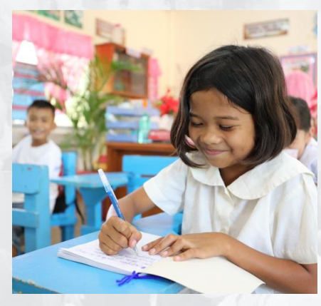
Learning involves progression where more complex skills are built on foundational skills.