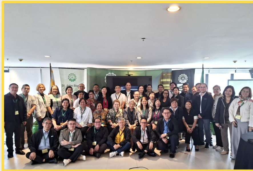
Training of HEI team chairpersons