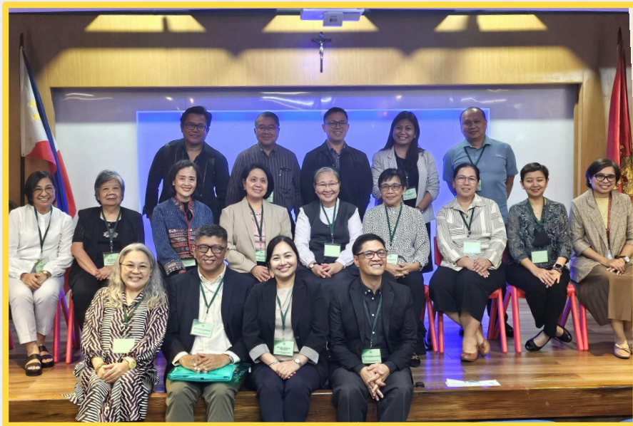
BED accreditors' training