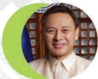
Hon. Juan Edgardo "Sonny" M. Angara Secretary, Department of Education

Secretary Sonny Angara has served more than two decades in public service—nine years as a congressman representing the Province of Aurora and eleven years as a senator.